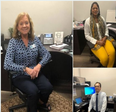
The Dare County NCWorks Career Center staff celebration, mask edition.