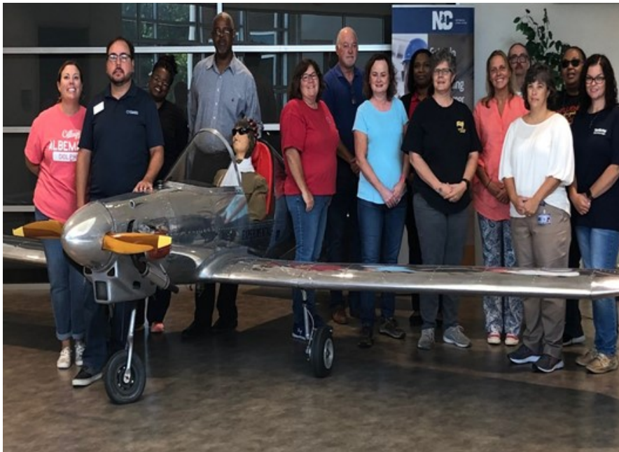
Caption (left to right): Participants of the boot camp pose with COA instructors at the Regional Aviation and Technical Training Center on August 7.