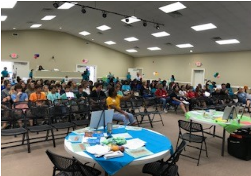
Caption: Students from the NWDB 10 County region ready to participate in the Real World Simulation, October 2, 2019.